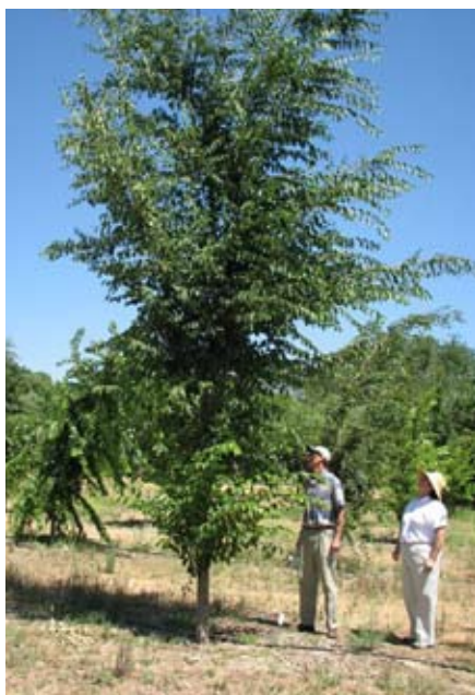
Figure 1. An Emerald Sunshine tree, one of the slower growing cultivars, seen in the UC Davis plot June, 2008.

bare root stock from J.F. Schmidt & Son were planted May 5, 2005 (Table 1). Five trees from each of the 14 cultivars were planted, or 70 total. Trees were spaced every 20-ft. (6m) in a four-row random block design. The trees were planted into a relatively flat, sandy loam soil. Vertebrate chewing on bark was minimized by trunk guards. During the first year trees were irrigated from a single drip emitter. They received approximately 13 gallons per tree twice a week during the summer, and reduced amounts during spring and fall. The trees received no irrigation from November through March, although weather